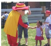
SunGuard Man demonstrates how to be safe in the sun.