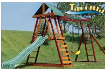
Photo representative of recalled models.

Product: Adventure Playsets Wooden Swing Sets